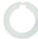
9. Nylon Washer P/N: 960-A-137