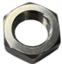
2. Wheel Nut for Straight Shaft P/N: F1-FJN