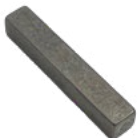
3. 1/4" Woodruff Key P/N: 684-250W