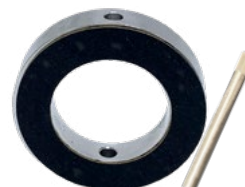
12. Cross-Pin P/N: 960-A-2069

336 Rebuild Kit (314-335) & Brake Kit (316-336-402-TSB)