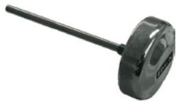
1. Brake Knob and Shaft P/N: 960-G-230-A-BSL7-5/8