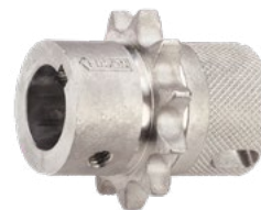
10. 11 Tooth Sprocket P/N: 855-2-11-TSB