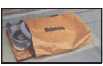
Optional Carrying and Storage Bag Order # 275-31