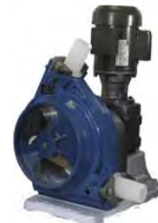
Model 286EP-1hp STD Peristaltic