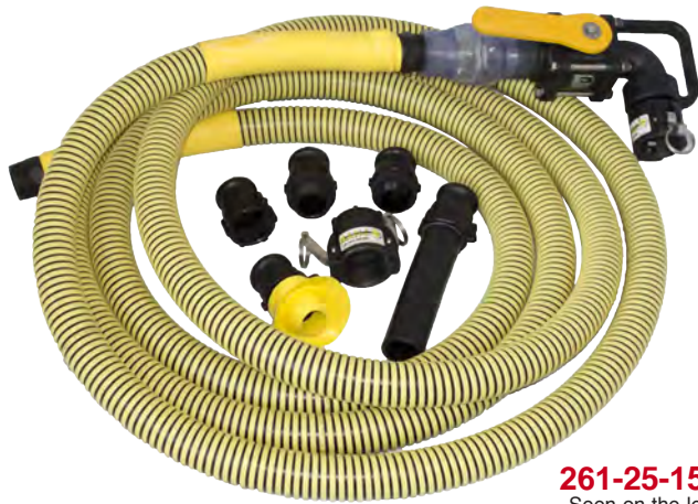
261-25-150 Seen on the left