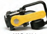
90° Ball Valve