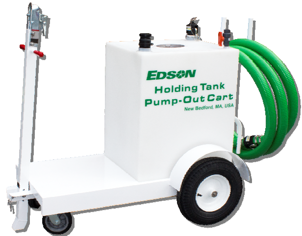
28206 Pumpout Cart (Shown without pump option installed)