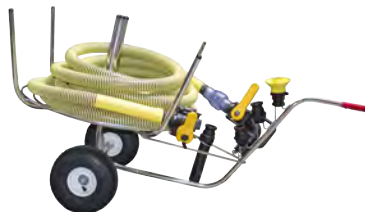
Portable Hose Handler #26050

50 ft to 100 ft Assemblies For Portable Pumpouts