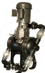
Model 25261 Double Diaphragm

The versatile cart is designed to accept our diaphragm pump options, or the powerful peristaltic options shown below.