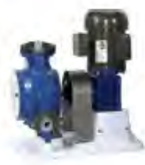
Model 286EP-.75hp Compact Peristaltic