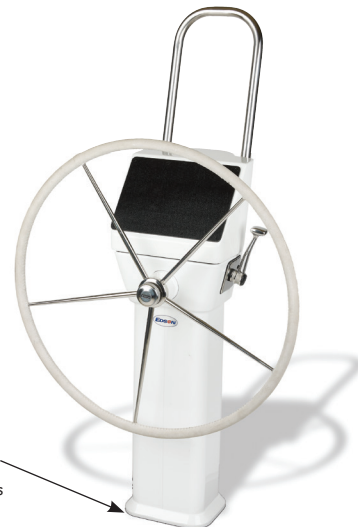
10.5" x 8.5" Base (Same bolt pattern as 300 & 400 series classic pedestals)