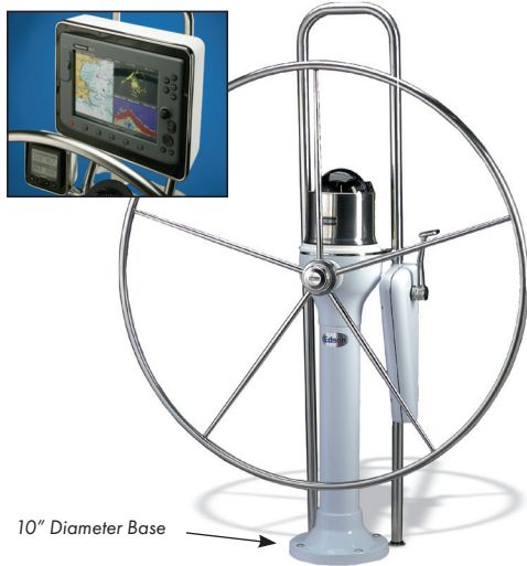
10" Diameter Base