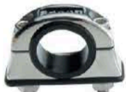
Clamp-on Mount #861-100 (only 1" and 1-1/8" Rails)