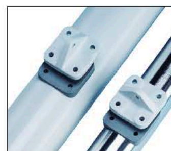
Flat Mount #979-22