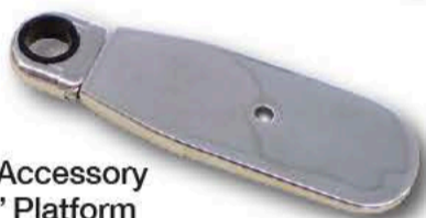
Clamp-on Accessory Mount - 7" Platform #832ST-7-125