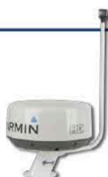
6" - #68010