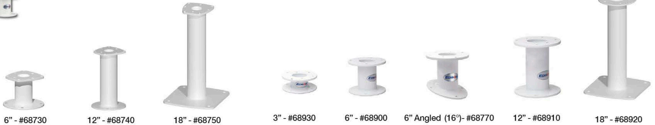
6" - #68730 12" - #68740 18" - #68750 3" - #68930 6" - #68900 6" Angled (16°) - #68770 12" - #68910 18" - #68920