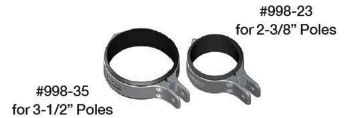
#998-35 for 3-1/2" Poles