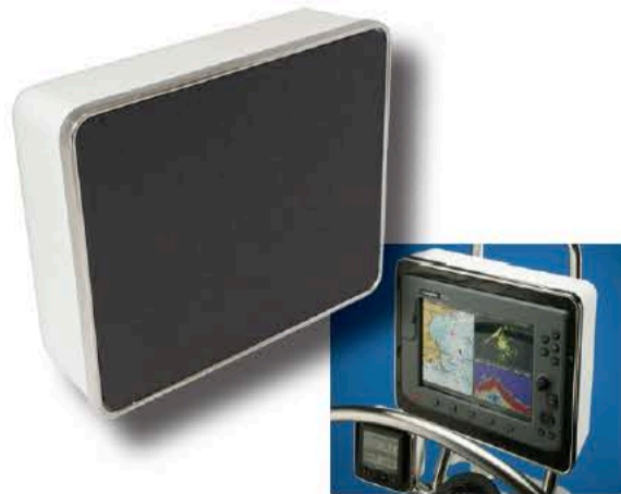
#2000-13x15 (Mounting Area: 15.00"W x 11.75"H)