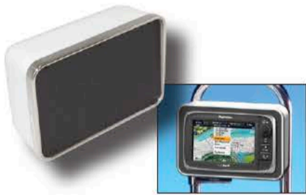
#2000-105x65D (Mounting Area: 10.20"W x 5.72"H)