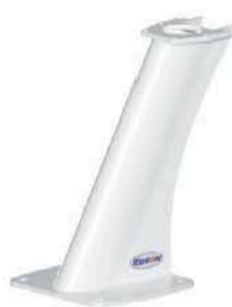
18" - #68030