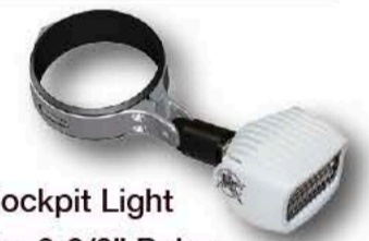
LED Cockpit Light #68161 for 2-3/8" Poles #68162 for 3-1/2" Poles