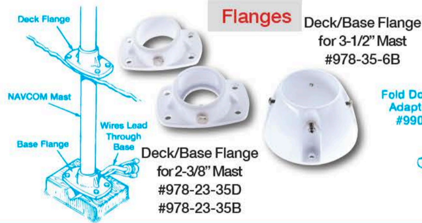
Deck/Base Flange for 3-1/2" Mast #978-35-6B