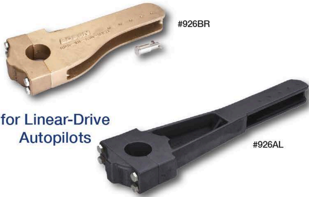
for Linear-Drive Autopilots