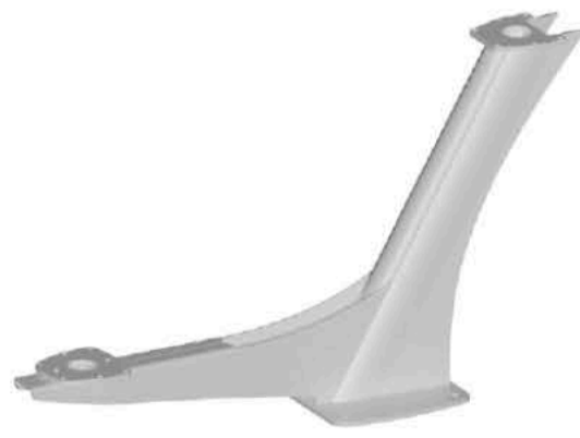
#68250 - 24" Height for 4' Open Array/Sat Dome