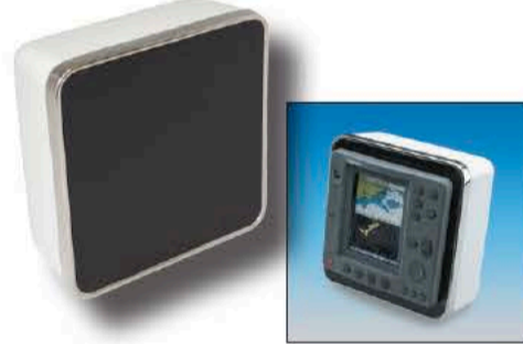
#2000-10x10 (Mounting Area: 9.50"W x 8.75"H)