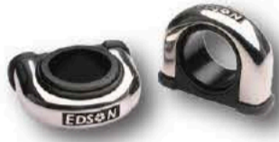
Clamp-on U-mount #861-100-125