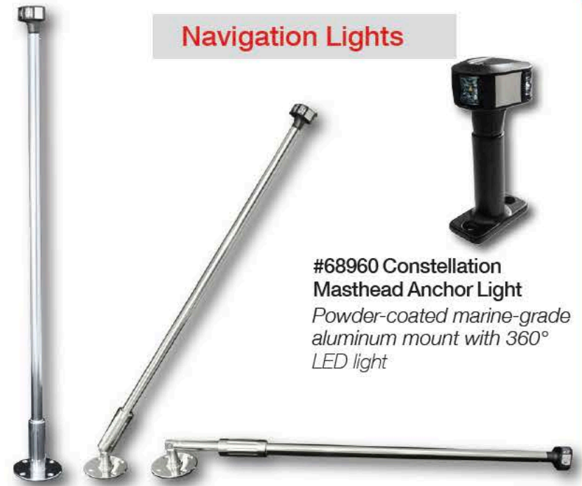
#68960 Constellation Masthead Anchor Light Powder-coated marine-grade aluminum mount with 360° LED light