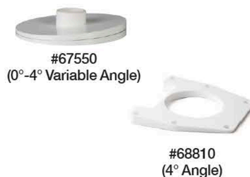
#67550 (0°-4° Variable Angle)