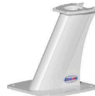
12" - #68120 4' & 6' Open Arrays