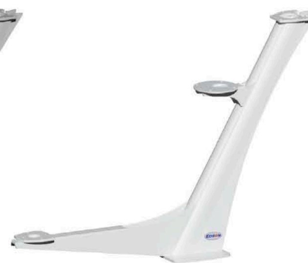
#68350 for 4' Open Array/Sat Dome