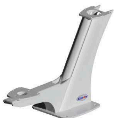
#68200 - 18" Height for Radar Dome/Sat Dome