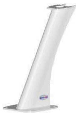
24" - #68040