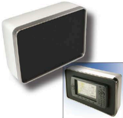
#2000-10x14 (Mounting Area: 13.90"W x 8.90"H)