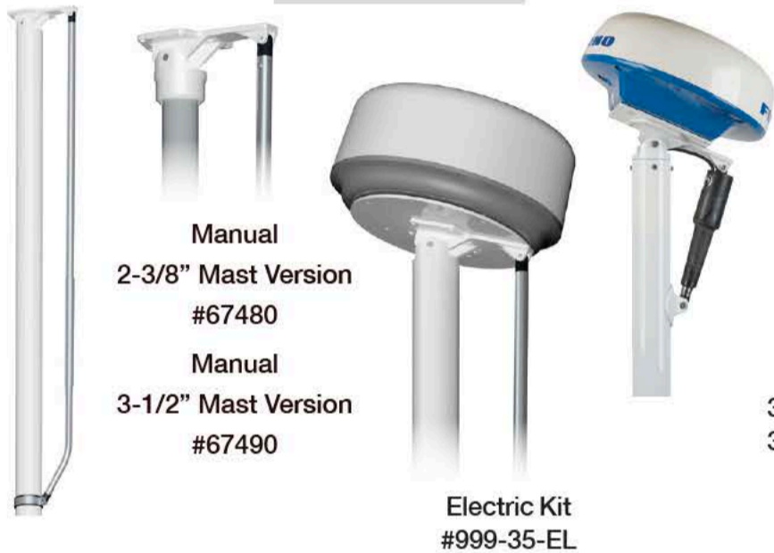
Manual 2-3/8" Mast Version #67480 Manual 3-1/2" Mast Version #67490