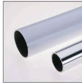
#983-35-X (3-1/2" dia.) #983-23-X (2-3/8" dia.)

Standard Pole Kit #67460 Anodized Aluminum pole 90" tall x 2-3/8" dia. 1" Rail Support Bracket Deck Mount Base Flange Includes top casting #68820