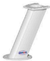
12" - #68020