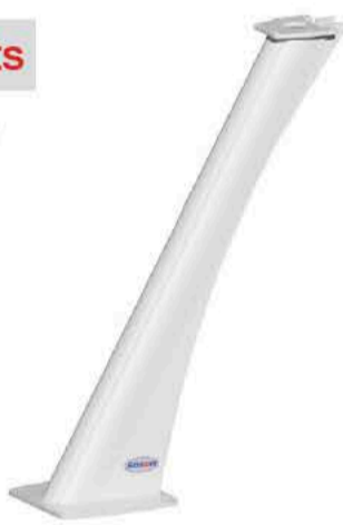
36" - #68050