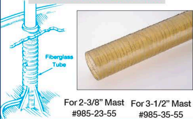
For 2-3/8" Mast #985-23-55 For 3-1/2" Mast #985-35-55