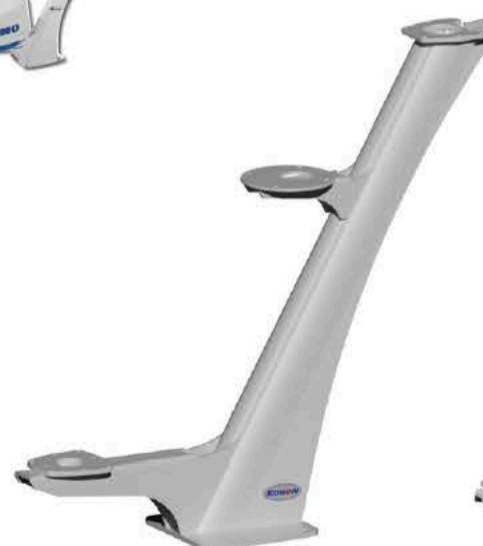
#68300 for Radar Dome/Sat Dome