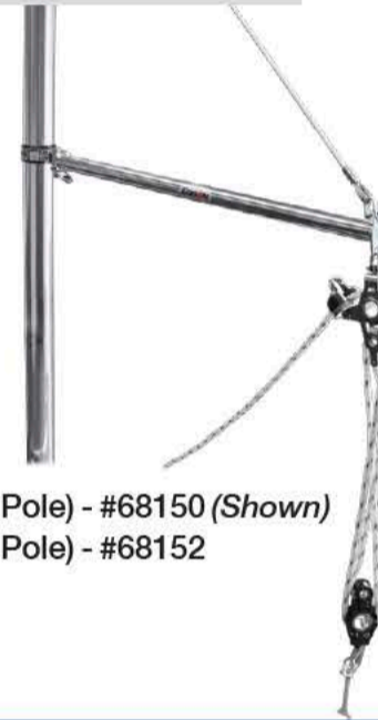
30" Lifting Crane (2-3/8" Pole) - #68150 (Shown) 30" Lifting Crane (3-1/2" Pole) - #68152