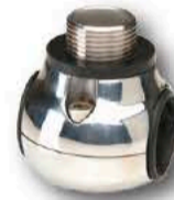
GPS Antenna Rail Mount #831ST-1-14