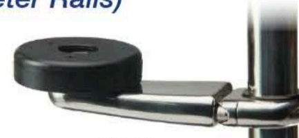
GPS Arm #830ST-3-100-125