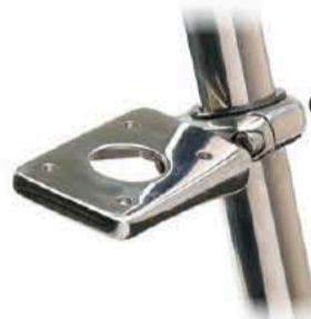
Clamp-on Accessory Mount - 3" Platform #832ST-3-125