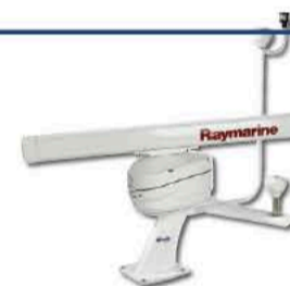
6" - #68110 4' & 6' Open Arrays