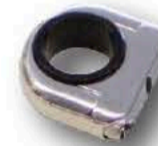
Accessory Clamp #861ST-125