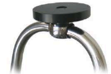
Horizontal Clamp-on Ball Mount with 3" Platform #831ST-3-DISK