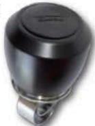
Sportsman Series™ #967-18BL